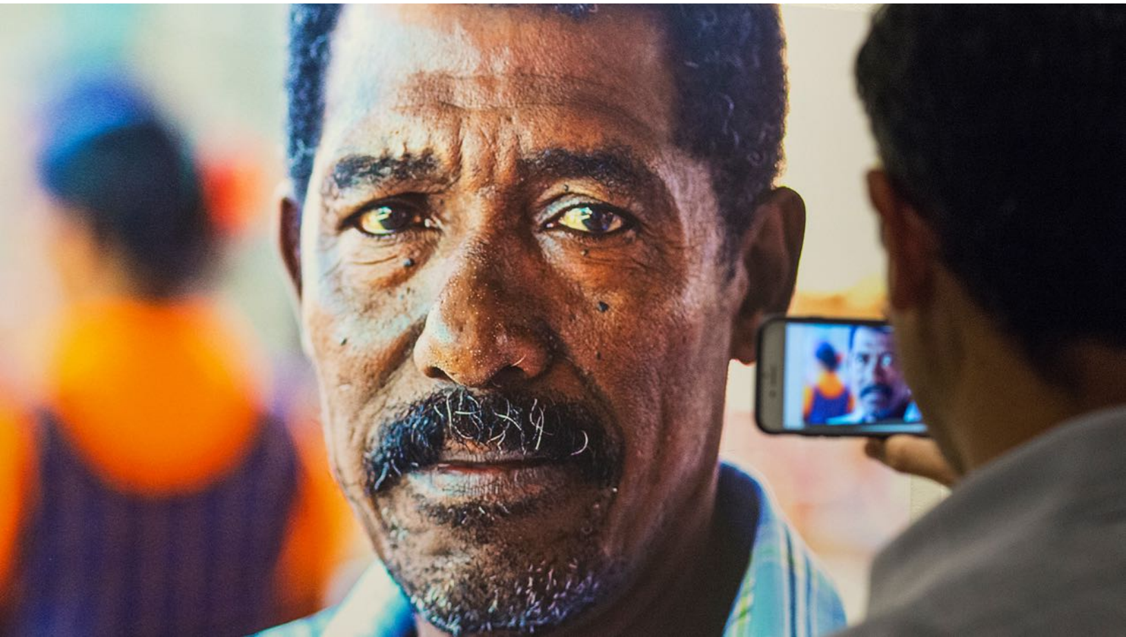
from Invisible Mexico exhibit at the Global Education Center, 2017.

As with most lasting progress, it appears that the change will be fueled by the people themselves. This movement is benefitting from the interconnectivity of globalism and the phenomenon of social media. YouTube channels and radio stations are regularly broadcasting news, art and entertainment for Afro-Mexicans by Afro-Mexicans. Such mainstream recognition may indicate that the veil of invisibility on this population is beginning to disappear.